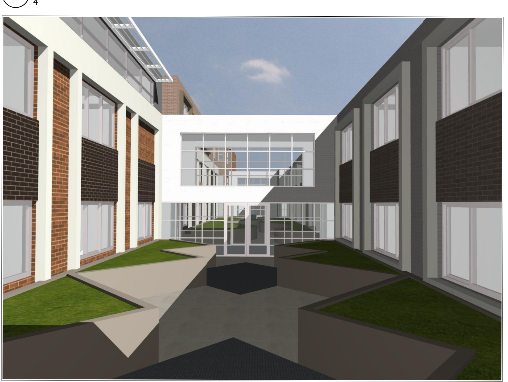
22 SEPT 2 PM - COURTYARD 2